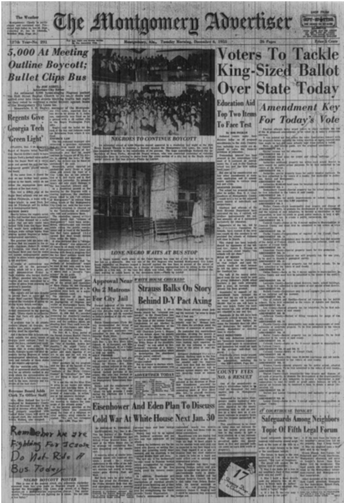
"5,000 at Meeting Outline Boycott; Bullet Clips Bus." Montgomery, Alabama, Bus Boycott. Montgomery Advertiser, December 6, 1955. The Montgomery Improvement Association (MIA) was formed to supervise the Montgomery Bus Boycott, a 1955 boycott of all Montgomery, Alabama, city busses by the city's African-American citizens. The boycott was prompted